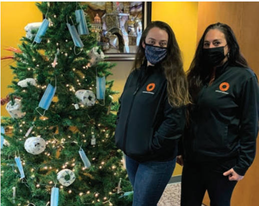
Synchrony Financial: Adopt-a-Family Project Sponsors